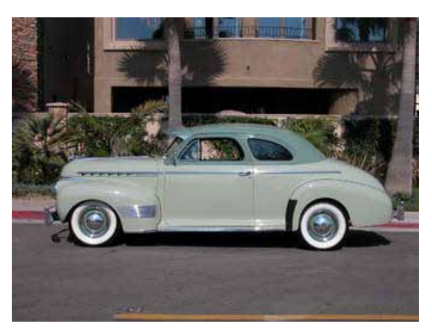
1941 Chevrolet two-door coupe, with 85 HP, 6-cylinder engine with 216.5 cubic inch displacement.

But for most folks locally, life was still pretty much the usual routine as some of the glimmers of prosperity continued to emerge after the Great Depression. General Motors' number-one car was the Chevrolet, and Fayette's Omar Foly Chevrolet thanked customers for a great year in 1940, as sales of the popular 1941 Chevrolet