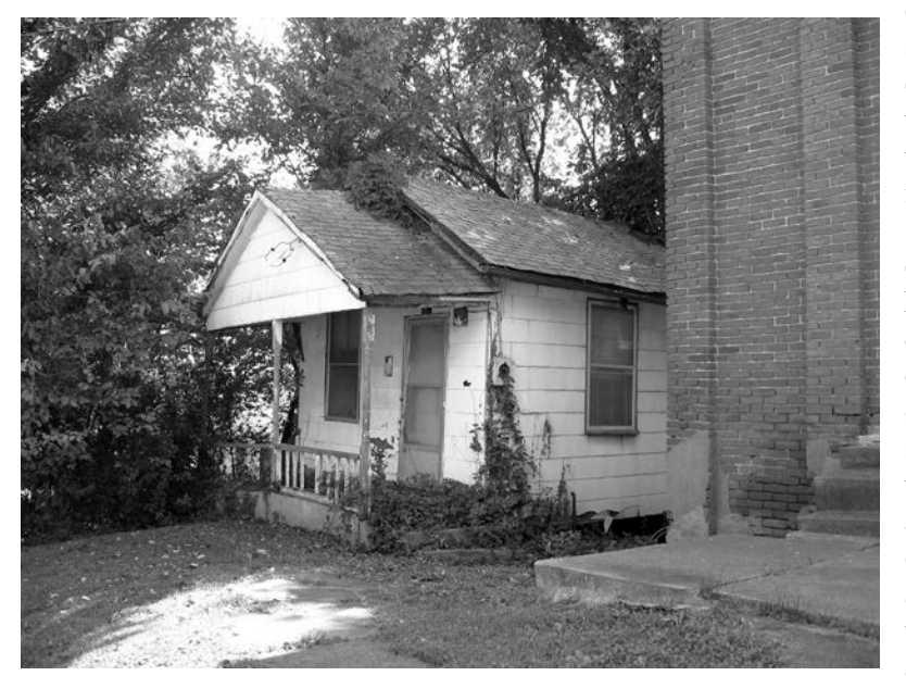
Before it was torn down several years ago, the Enyard family's 500-square-foot shotgun house stood next to Campbell Chapel AME Church in Glasgow. A five-room house, it was a rare example of the shotgun style. The first two rooms were bedrooms and it had a small basement kitchen. The house had not been lived in for some time.

very different roof types, both of which are typical of shotgun houses from their original development in the tropics through their rural and urban manifestations nationally: front-gabled; and hipped. The McQuitty example utilized a full front gable that constitutes the upper façade, while Crockett's structure was distinctly hipped. Apparently, roof type was a matter of preference; Cailles the Caribbean and shotguns throughout the South exhibit both styles with equal frequency. As with all shotgun houses, the Crockett house porch was an integral part of the family's living space, and with the exception of some