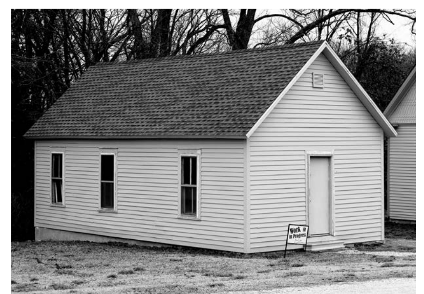
The partially restored McQuitty shotgun house which is now located on the grounds of the Boone County Historical Society Museum.

in slavery and in freedom. they brought their culture: by the early 1890s, shotgun houses were firmly established in black St. Louis, where they were built relatively inexpensively, and in numbers. As the turn of the century neared, the shotgun house also became a notable transplant in smalltown black communities throughout the state. Shotgun houses never appeared in townhouse-like rows or in any considerable number individually in smalltown Missouri, but with their most visible design feature—a gable-end front facade-even the modest