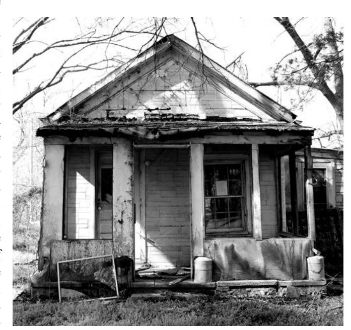
The abandoned Vivian shotgun house in southeast Glasgow is one of the few surviving structures in the Boonslick Region of that historic type of architecture. It was built in the 1920s.

Sedalia, an important railroad hub with a significant black community in the late nineteenth and early twentieth centuries, once contained literally dozens of shotgun houses within a roughly eight-block area, the city's traditional segregated neighborhood north of the downtown railroad yard.14 Today, this same neighborhood contains ten identifiable standing structures, perhaps more than in any single location in the state outside of St. Louis and Kansas City. The plethora of narrow vacant lots, often highlighted by remnants of fences, entry walks, and concrete porches, speak of an era when, at least in Sedalia's black community, the shotgun form rivaled that of the vernacular mainstream.