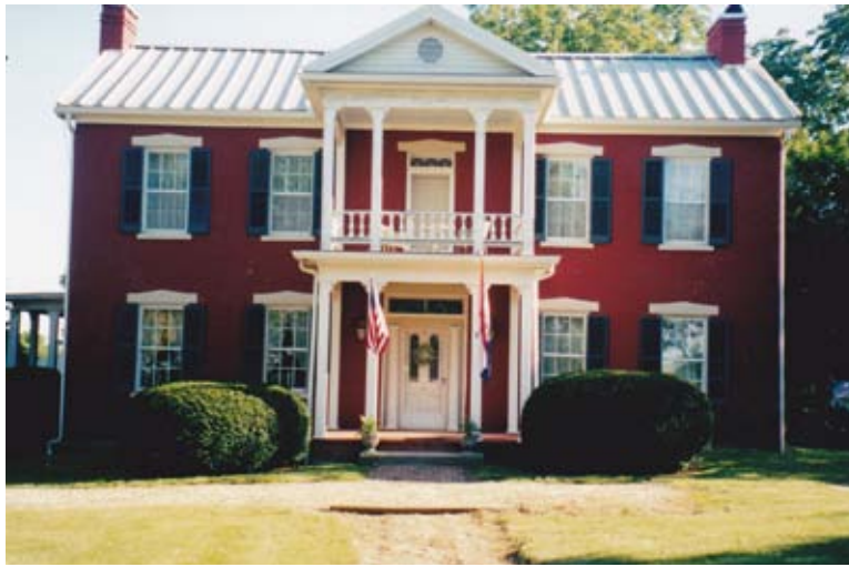
Above, contemporary photo of Pleasant Green Plantation, circa 1820. Below left, historic photo showing second area (1872) post office that was relocated behind the house when it closed several years later. Below right, hexagonal barn, circa 1900, built at Pleasant Green, is no longer standing.

The Boonslick Historical Society was founded in 1937 and meets several times a year to enjoy historical topics pertinent to the Boonslick area. Society members have worked together over the years to publish historical books and brochures and to mark historic sites. The Society supported the founding of Boone's Lick State Historic Site, marked the sites of Cooper's Fort and Hannah Cole's Fort and restored a George Caleb Bingham painting on loan to The Ashby-Hodge Gallery of American Art.