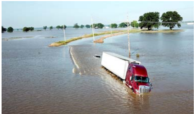
MISSOURI RIVER FLOOD of 2019: Above, passenger van and semi-trailer truck stalled on HWY. 240 west of Glasgow in late June. Below, photo from Glasgow looking out over the river and Saline County bottoms after levee failures caused flooding throughout the Boonslick region.